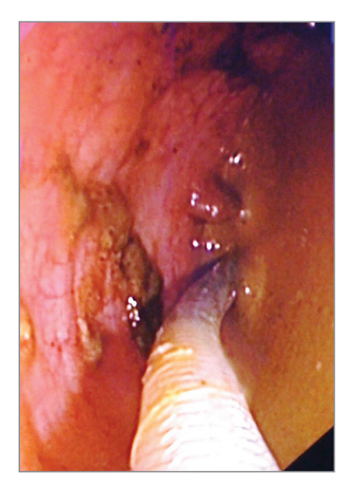
Fig. 1. A guide with a stent is introduced via the tumor lumen during colonoscopy

The patient was discharged without complications on the 6-th day in the satisfactory condition with recommendations to be treated by polychemotherapy and other administrations made by oncologist.