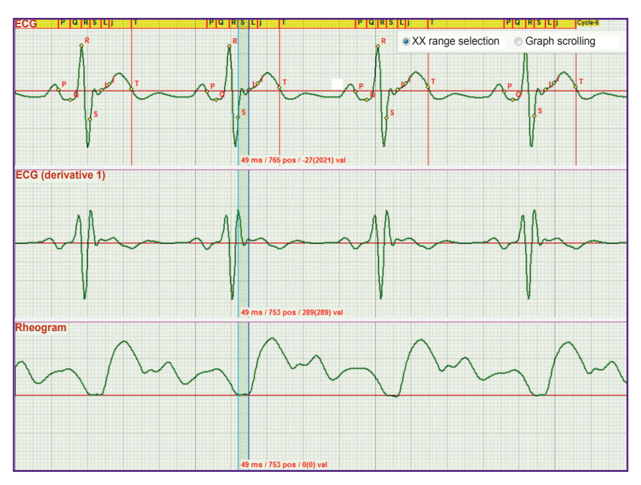
Figure 1. Synchronously recorded ECG and rheogram

As seen in Figure 1, a small wave on the ECG corresponds to the moment of the beginning of the rheogram curve rise. The investigations have shown that