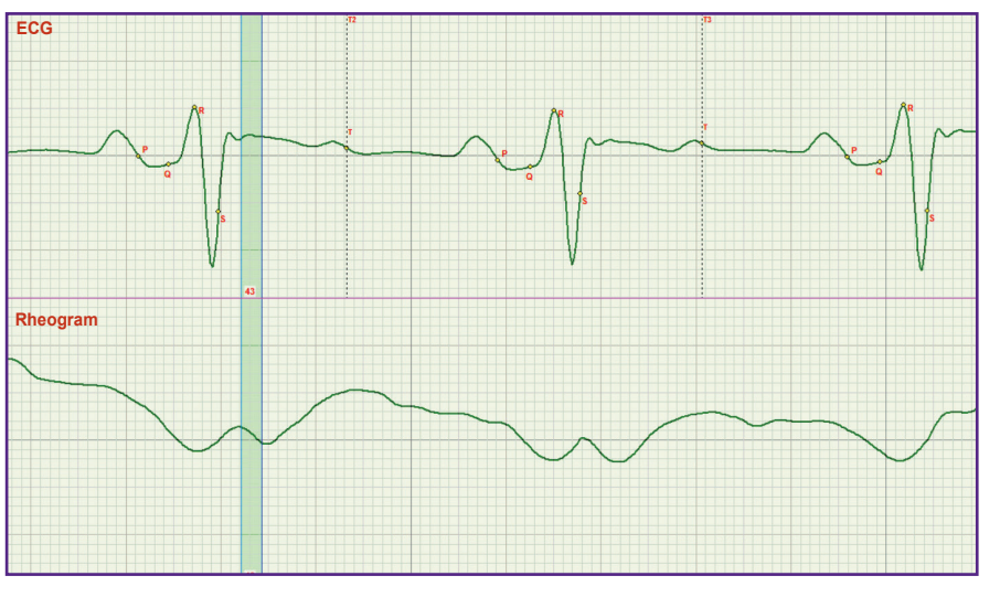
Figure 4. Absence of the normal development of the rapid ejection phase The curve of the rheogram has a negative slope in the marked rapid ejection phase

Understanding the mechanism of formation of these phases will give cardiologists the possibility to have a key to the exploration of unknown mechanisms of the cardiovascular system functioning which still keeps