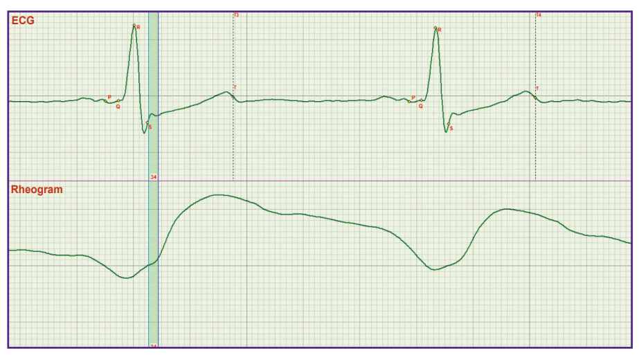
Figure 3. The possibility of qualitatively assess the alterations of filling the aorta with blood when the aortic valve is closed

Previously [9], an ECG and rheogram recording has also been used but it was a multichannel lead ECGs and rheography of the chest which covers the processes of filling all the chest organs with blood. Not knowing the exact location of one of the key points S, synchronization of the rheogram was performed by fixing its minimum to the isoline. In the given work, the rheogram isoline was fixed at the point corresponding to the S point [9]. The exact definition of the S point position made it possible to analyze the mechanism of regulation