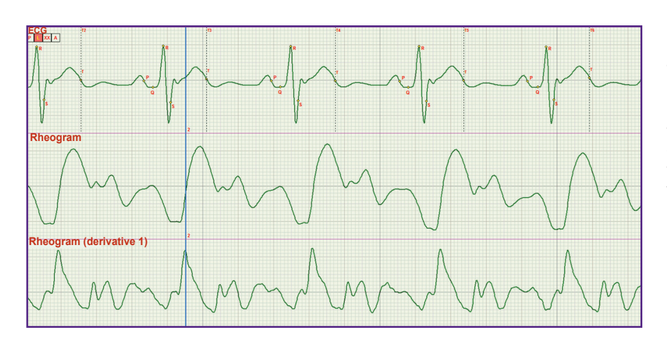
Figure 2. Synchronously recorded ECG and rheogram

The j point corresponds to the bend point of the ascending part of the reogram curve and is determined by the maximum of the first derivative of the rheogram. This corresponds to the end of the second small ECG wave before the T point