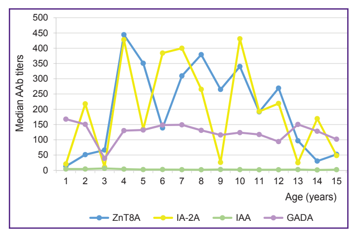
Figure 3. Median AAb titers depending on the age of T1DM manifestation

N o t e. Statistically significant differences when comparing the groups: * p<0.001; ** p=0.08 (in the T1DM group); * p=0.07 (in the group without T1DM).