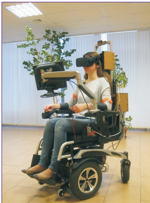
Figure 3. The intelligent wheelchair prototype that has sonar rangefinders, a video camera, a multichannel motor controller, controllers for the rangers, a laptop with ROS, myographic sensors, a vibrotactile communication, virtual reality glasses

The prototype is managed by controller, which